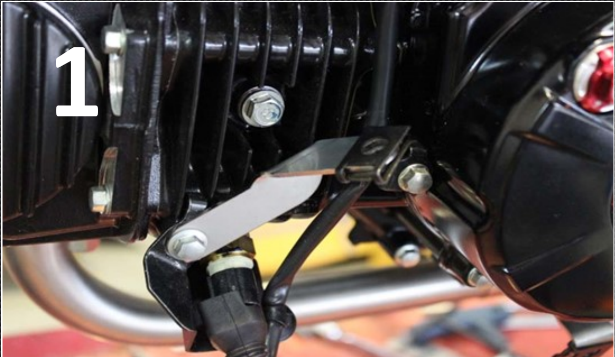
1) Front left stay uses the thermostat mounting bolt and fitted as shown in the photo.

The first job is to install the stays. At this stage install hand tight so that stays can be adjusted if necessary.