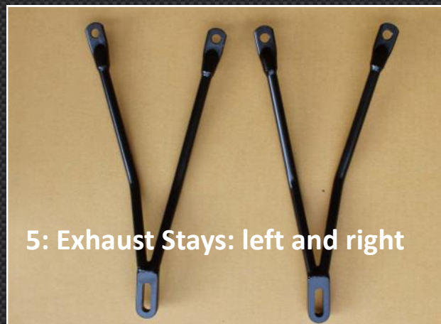
5: Exhaust Stays: left and right

5) Attach TYGA exhaust stays using original mounting hardware