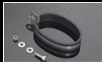
1x Clamp Oval