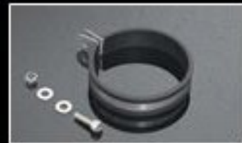
1x Clamp Round or